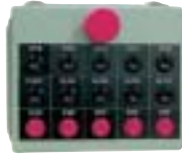
Master Control Station