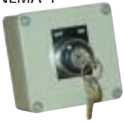
Keyed Switch NEMA 4