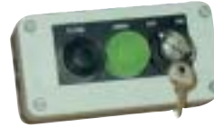
Key-Locked NEMA 12